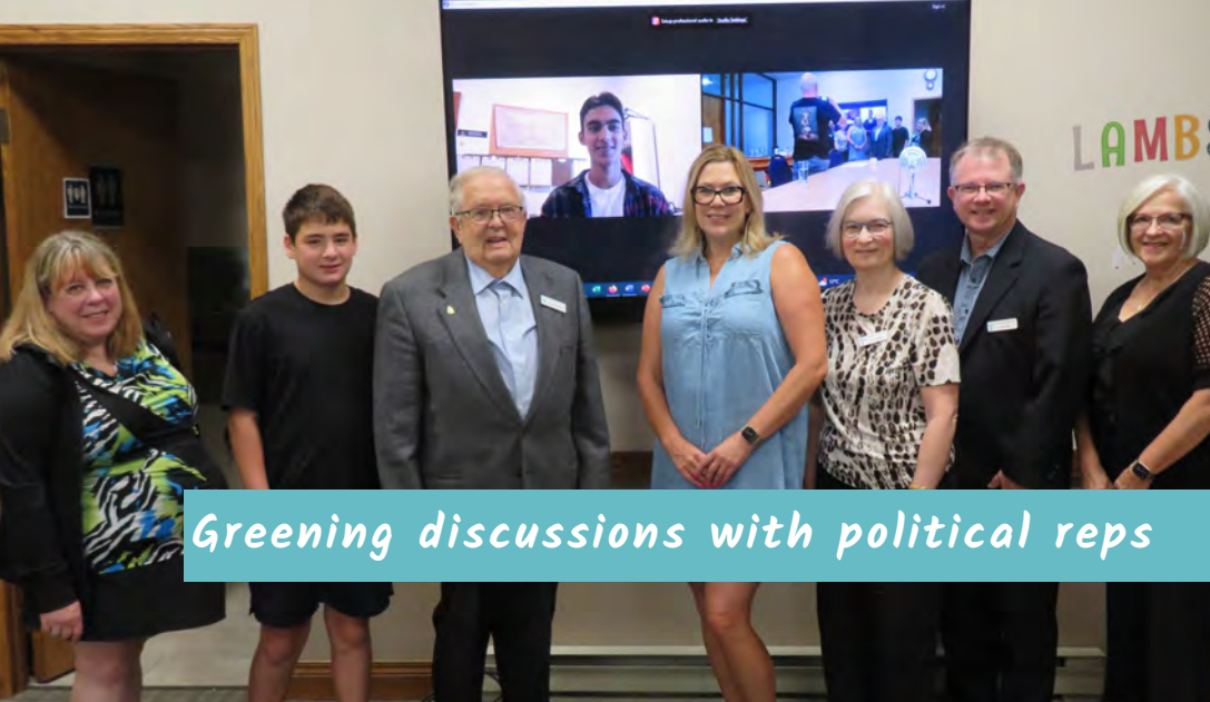
Greening discussions with political reps