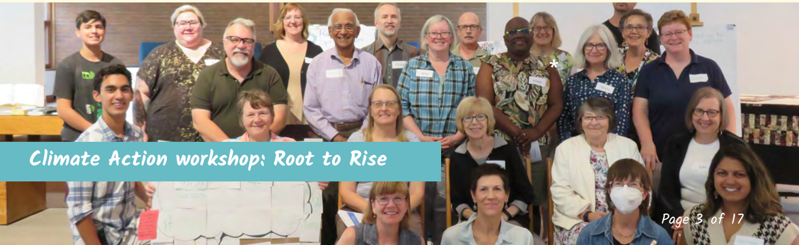
Climate Action workshop: Root to Rise