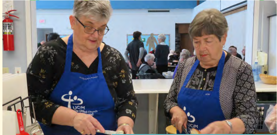
Programs for Seniors