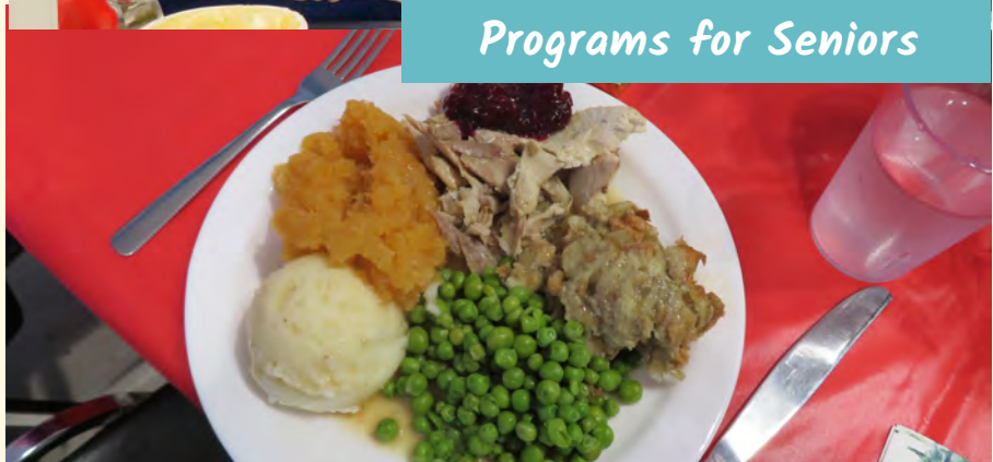
Providing Hospitality and Welcome