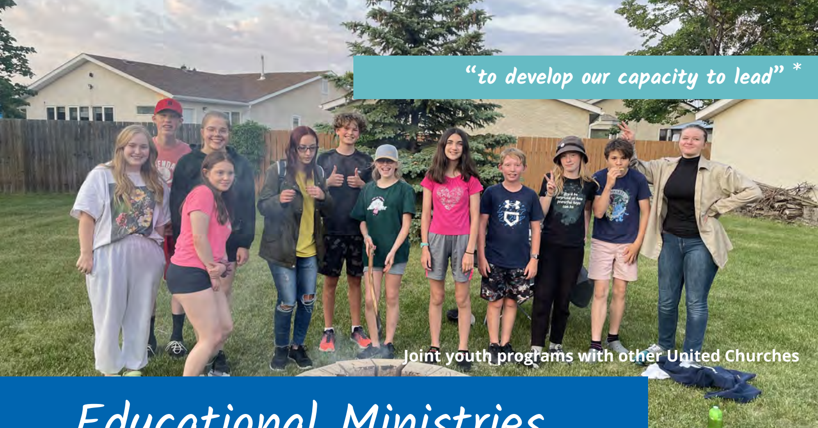
Joint youth programs with other United Churches